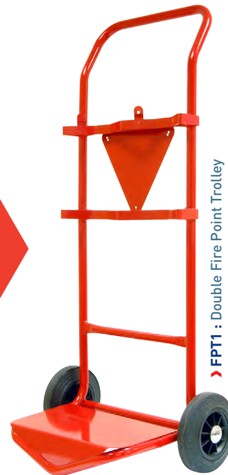
➤ FPT1 : Double Fire Point Trolley