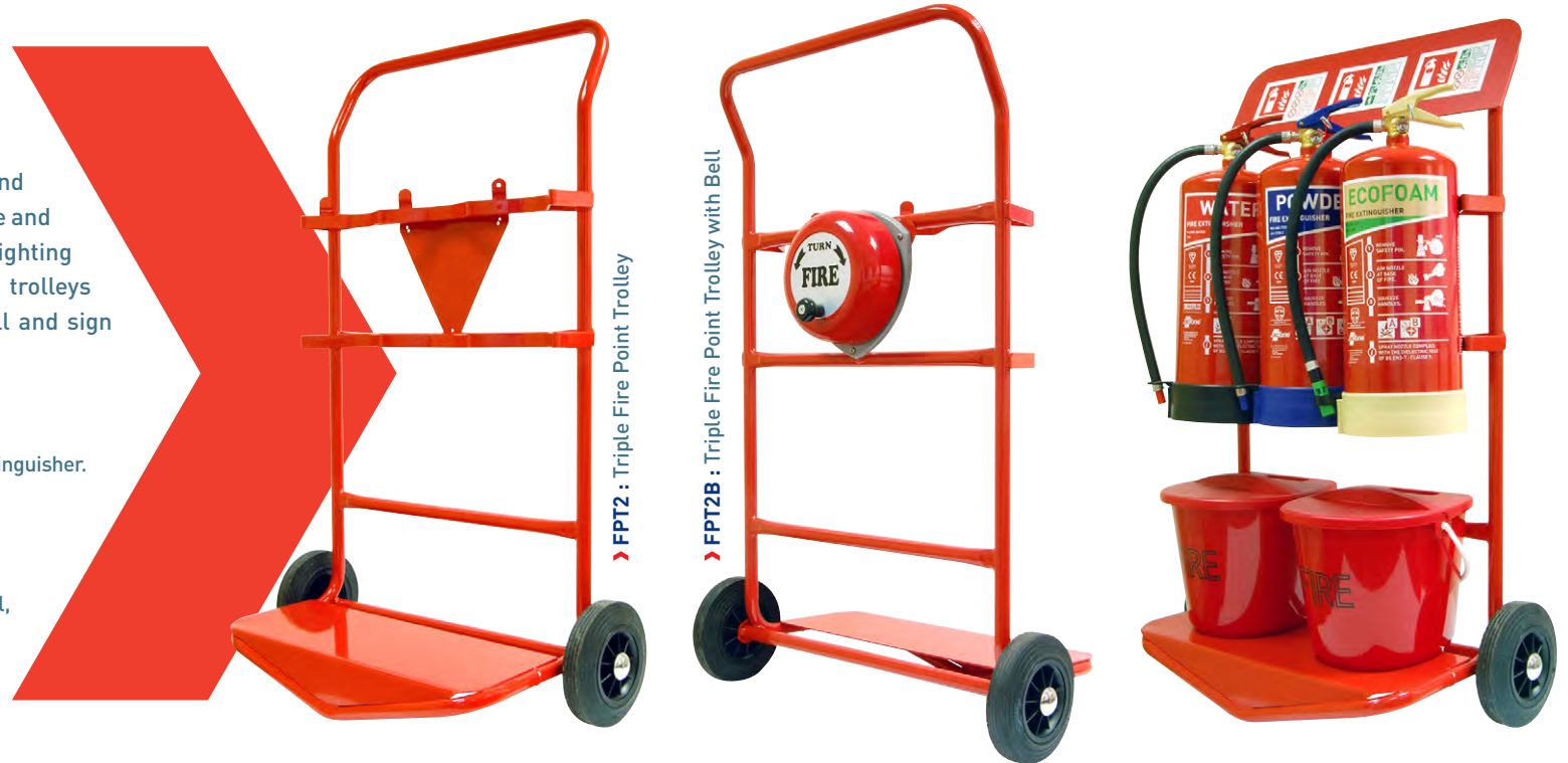
➤ FPT2 : Triple Fire Point Trolley