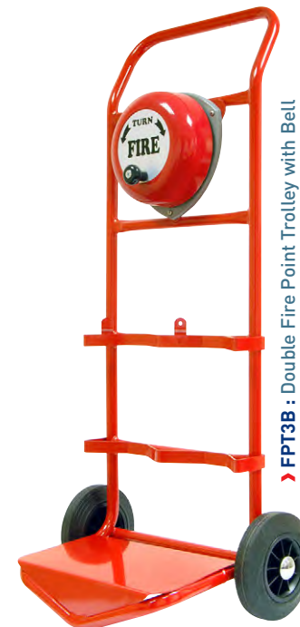
➤ FPT3B : Double Fire Point Trolley with Bell