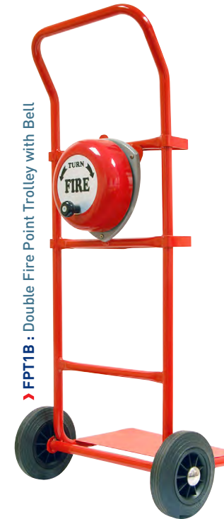
➤ FPT1B : Double Fire Point Trolley with Bell