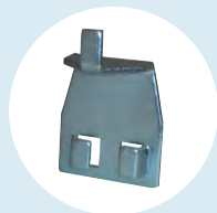
➤ BF007 : Adaptor Bracket