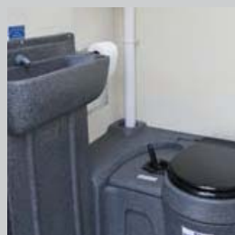
Toilet wash area