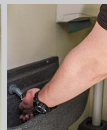
Delivery of hot water