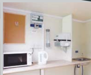
Well equipped canteen