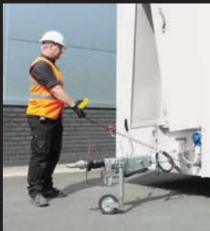
Unhitch from towing vehicle and operate hydraulics using the push button controls

Fast deployment time means more time on the job, making it the money saving choice of welfare unit for rental companies and contractors.