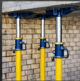
In Use on Site