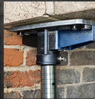
Double Cavity Wall Support

BUILT TOUGH • TESTED SAFE • READY FOR THE JOB