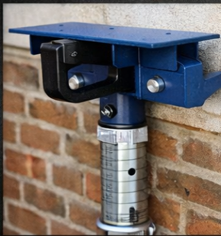
Rear Handle Design